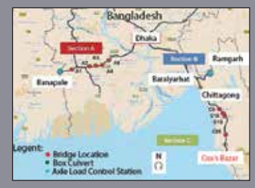
Cross-border Road Network Improvement in Bangladesh